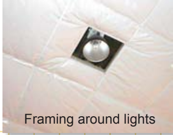
Framing around lights