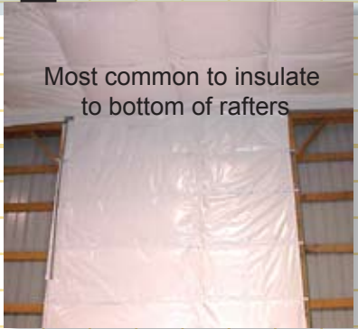
Most common to insulate to bottom of rafters